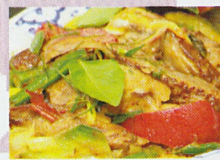
Sexy Little Duck